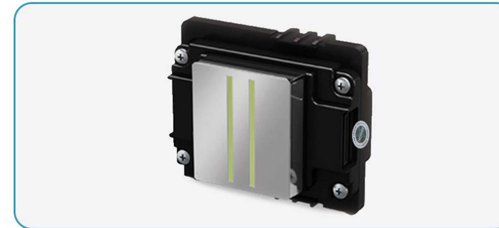
I1600 Printer Head